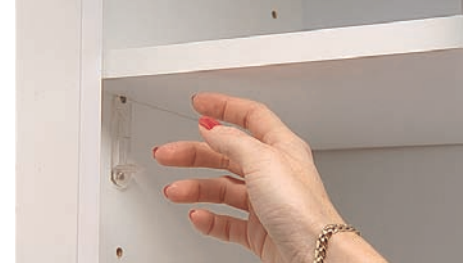
Shelves are 3/4" plywood for improved strength and are adjustable in both base and wall cabinets.