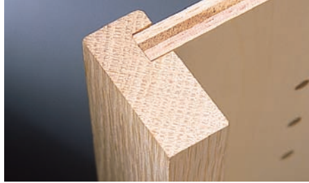
All wood box construction gives added strength to Kabinart's wood cabinets.

Arts & Crafts Maple and Cherry from Kabinart's Classic Series - an unparalleled combination of features and quality providing years of dependable use and beauty for your home.