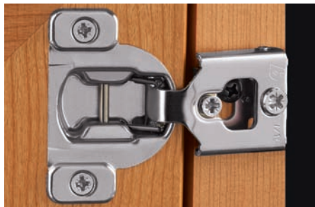
Concealed hinges with 6-way adjustability on traditional overlay doors carry a life-time warranty - extra value at no extra cost.