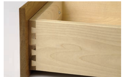
Our premium drawer boxes are assembled with solid wood sides using quality dovetailed joints at each corner, a mark of fine crafted furniture for hundreds of years. Available as an option on the Classic Series.